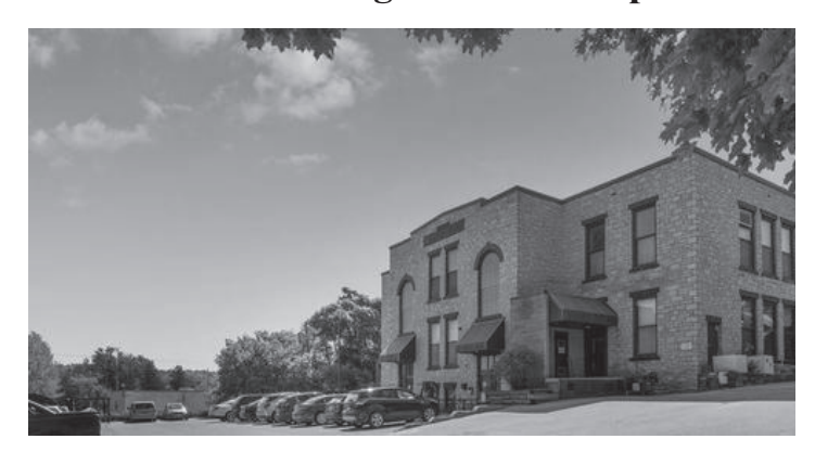
Photo : COVID-19 protocols are back in place at Manitoulin Lodge in Gore Bay following a declared outbreak of the virus. Essential visitors are the only type of visitors allowed when a resident is isolating or resides in a home or area of the home in an outbreak. Photo provided and used with permission.

More residents and staff of the Manitoulin Lodge on Manitoulin Island have come down with COVID-19.