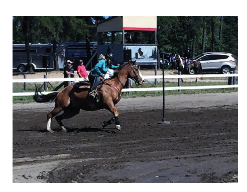
Photo: The 115th Massey Fair is just around the corner with this year's theme focusing on The Year of the Garden. The three-day event will include the midway, plenty of horse shows, exhibits, games and so much more.

Massey Fair 115 Returns With Year of the Garden Theme